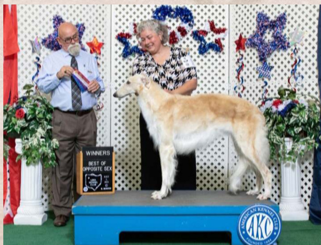
"AVA" CH RUNTUFF TICKLE ME PINK JC

Bayla and Bodie from the Starswift Deadliest Catch litter will be 10 years old in December; they are enjoying retirement