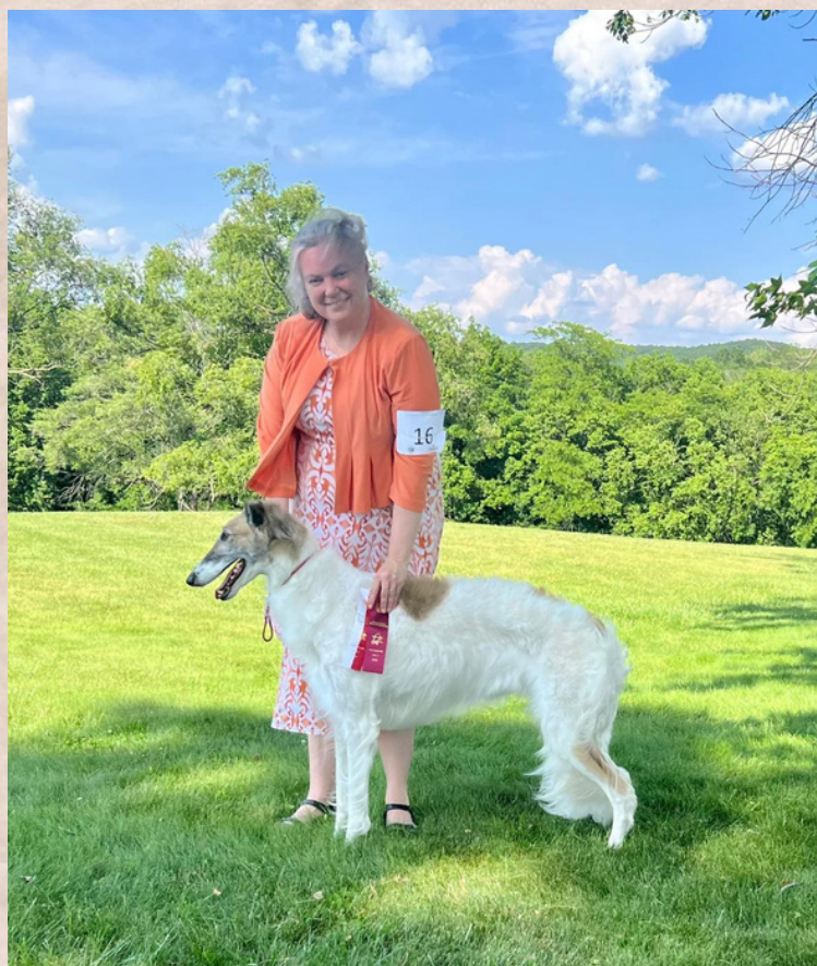
"PIXIE" GCH DC RUNTUFF RIVERRUN MANIC PIXIE DREAM

2023 has been a good year so far for Brossok Borzoi family. "Pixie" GCH DC Runtuff Riverrun Manic Pixie Dream finished her grand championship.