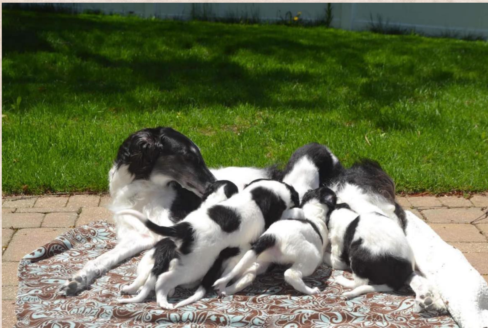
Dove pictured with the "Heart" Litter