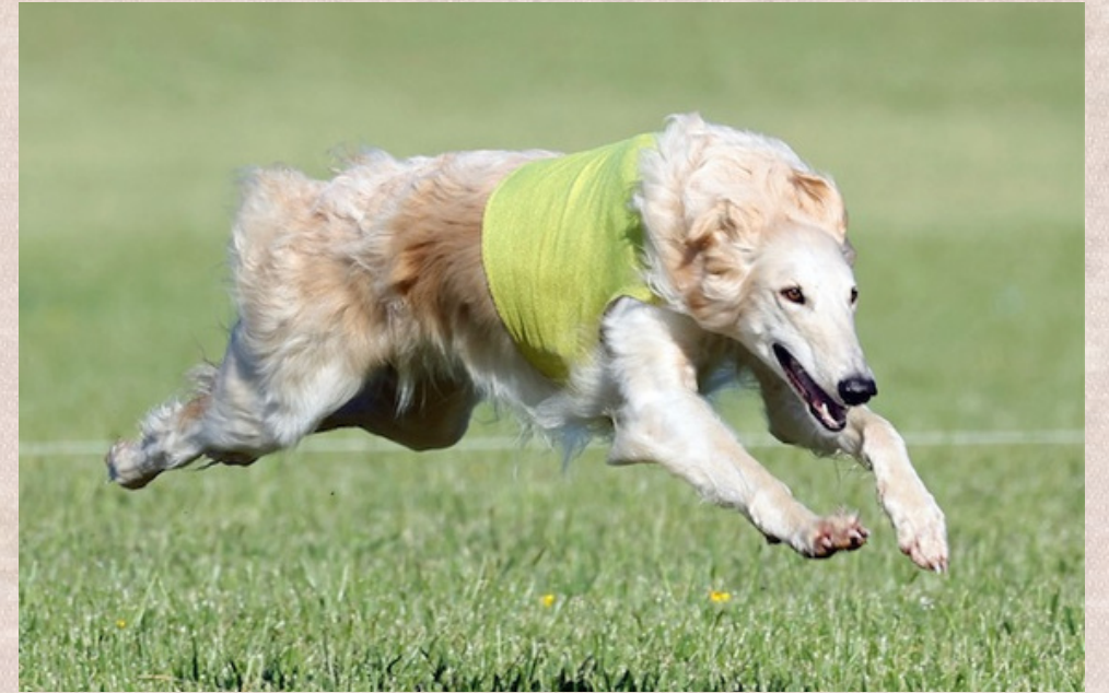
FC KINOBI SUNSHINE ON MY SHOULDERS SC