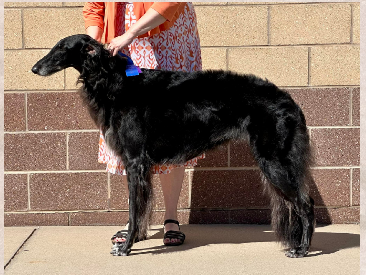
"NINA" BROSSOK RUNTUFF BLACK GOLD BN CGC

These titles gave their mother "Ash" DC Riverrun Oxota Fire in the Glen Avalon RN MC CGC FCh, ORC, SGRC2, VLAA her ROM (pending paperwork).