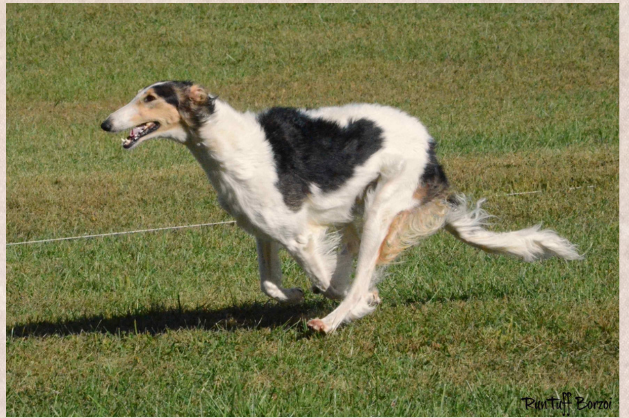
"PIPER" CH WINDRIFT YOUNG AT HEART JC

We've also been to a few dog shows. Collin (Windrift You Can't Hurry Love) has earned a major and one single. Flynn (Windrift Take it To The Limit JC) has added three singles to his 5 point major specialty WD, BW from last fall. Both are shedding badly now so the shows might be over for this year.